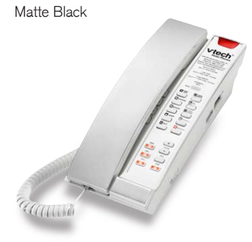
Silver and Pearl