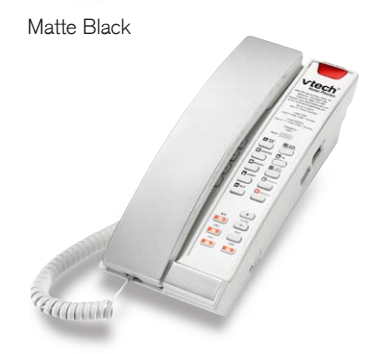
Silver and Pearl